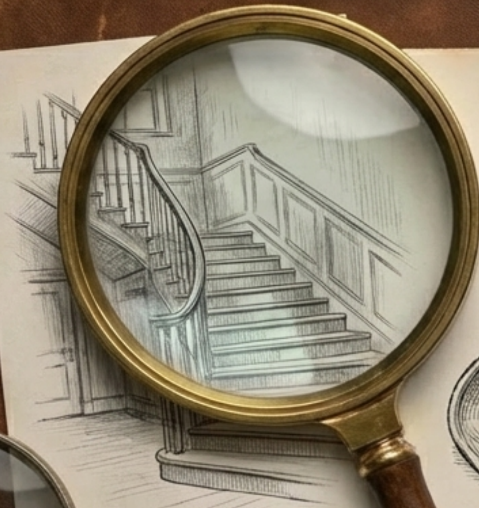
Exhibit 1: The Baker Street Stairs

You have seen the stairs hundreds of times, but do not know there are exactly seventeen steps.